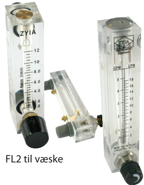
FL2 til væske