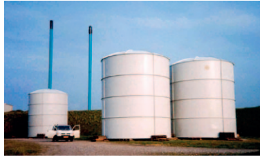
Tanks above ground