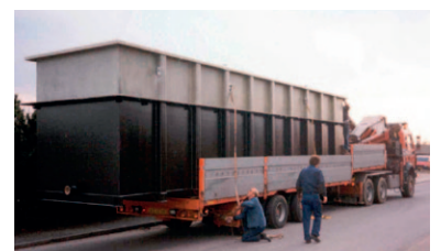
Pools and vessels