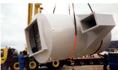
Scrubbers and deodorizing systems