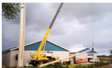
Chimneys and cores