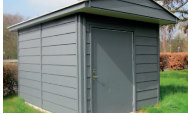
Pump station superstructures