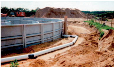
Composite pipes and fittings