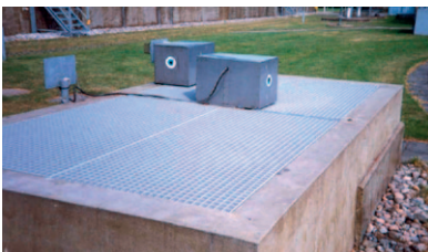
Grates, covers and cabinets