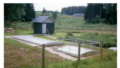
Mini purification systems