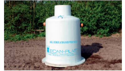
Grease- and oil separators