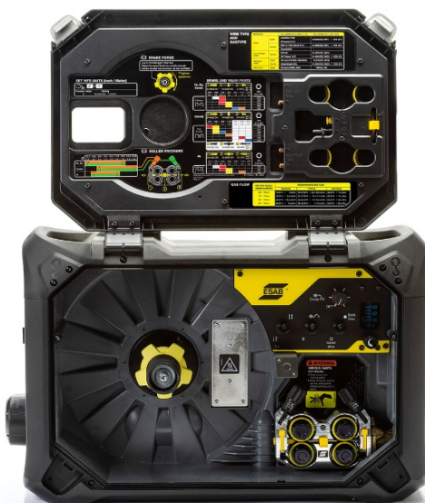
Internal LED lights and integrated storage for wear parts in lid