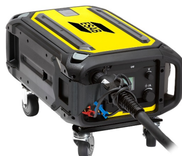
Wheel Kit and Torch Strain Relief works with feeder horizontal or vertical