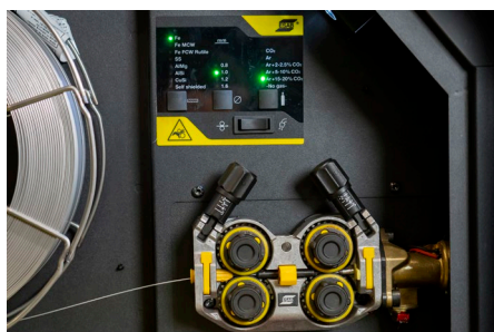
Best in class wire feeding mechanism