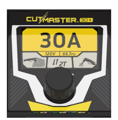
Simple and intuitive TFT LCD panel

Cutmaster 30+ is the perfect combination of power and portability for hand-held plasma cutting machine. Plus means more, so we've added a user-friendly 4.3 in. TFT LCD screen and upgraded features that give you even more control and flexibility to master any cut up to 10 mm (3/8 in.). Together with the SL60 1Torch, it all adds up to the total plasma cutting package.