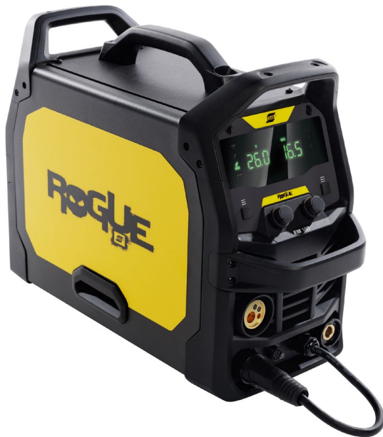
Rogue EM 180

ESAB Rogue EM 180 is an inverter-based MIG welding system designed to address all your welding project needs, from light fabrication to repair and maintenance. The system features industrial-grade arc performance and full featured controls that allow the welder to fine tune arc characteristics based on the material they are welding.