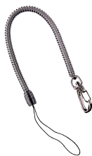
A42001-9 Clip-on Coil Lanyard