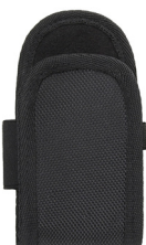
A41014-7 Universal Safety Knife Fabric Holster