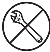
easy, no-tool blade change