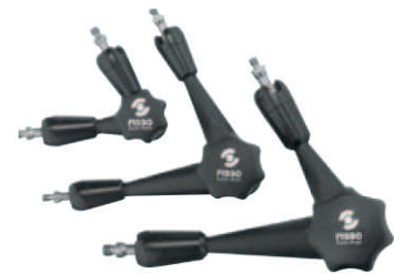
Strato Line articulated arms 4.030-4.160