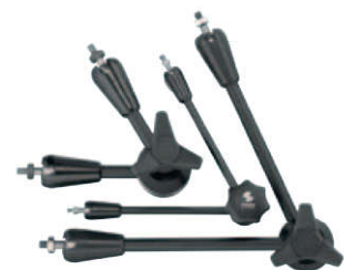
Classic Line articulated arms 1.320, 3.307, 3.308