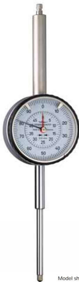
Model shown: M 2/50 S