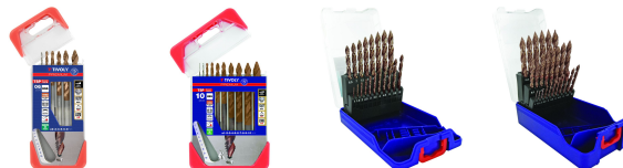
6 HSS metal drill bit coated FUSIO Grinding Tivoly Smart Point Ø1 to 8mm 10 HSS metal drill bit Coated FUSIO Grinding Tivoly Smart Point Ø 1 to 10mm 19 HSS metal drill bit Coated FUSIO Grinding Tivoly Smart Point Ø 1 to 10mm 25 HSS metal drill bit coated FUSIO Grinding Tivoly Smart Point Ø 1 to 13 mm