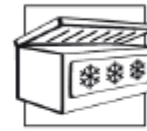
Freezer (Subject to individual trials)

Micro-wave oven For defrosting and reheating. Avoid direct contact with food. Migration tests carried out in distilled water at 100°C for 1 hour