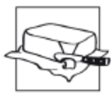
Margarine and butter

10. The above mentioned film is suitable for wrapping foodstuffs as examples described below