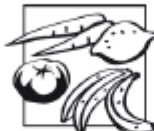
Fruit, vegetable and frozen product