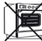
Traditional oven, infrared oven and multi purpose oven

The recipient should pay particular attention to any change in the packaged product, its intended use and also to any modification in the material's processing conditions and make sure that the contents and packaging are compatible, as directed in this declaration.