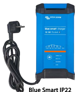
Blue Smart IP22 12/30 (3)