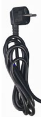
AC cord (must be ordered separately)

Plug options: Europe: CEE 7/7 UK: BS 1363 Australia/New Zealand: AS/NZS 3112