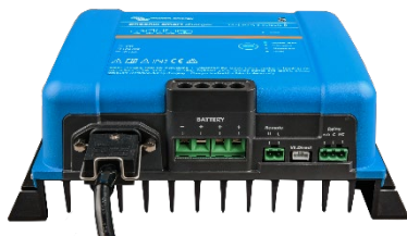
Phoenix Smart 12/50(3)